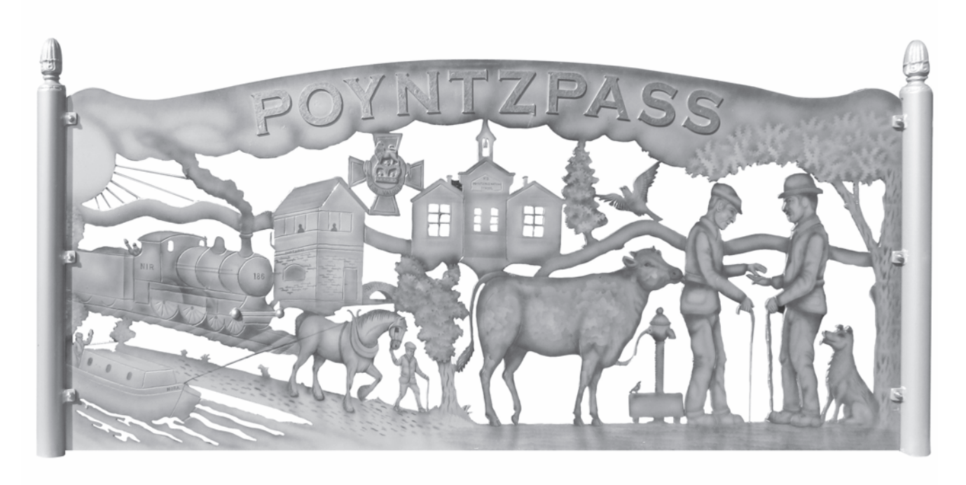
Artist, Billy McCaughern was also responsible for this frieze depicting Poyntzpass through the Ages, which was erected as part of a rural village enhancement scheme organised by Armagh City Council. The artwork depicts the growth of the village though the ages by including those elements which were important in its evolution.