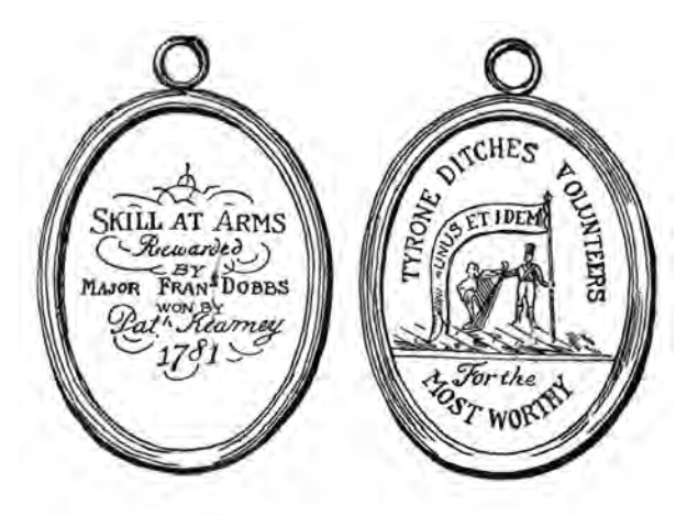
The medal presented to the Acton and Tyrone's Ditches Volunteers

At the end of the seventeenth century Ulster had been the poorest province in Ireland, and the early part of the eighteenth century was characterised by terrible hardship because of repeated harvest failures. However, the introduction of new technology in linen-making in the 1740s gave a dramatic boost to the province's economy. Added to this, the potato was introduced which provided better sustenance. New markets were opening up in the colonies and as international trading conditions improved Ulster became the most prosperous of the four provinces.