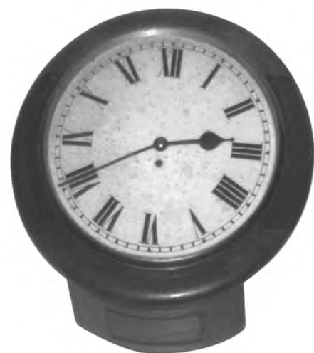
The school clock in the Headmaster's room

In those days many pupils didn't leave the primary school until they were fourteen and the "big" boys and girls went to woodwork and cookery classes respectively