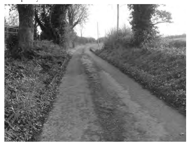
The Old Road

Most, if not all of the drumming party attended Mass in Poyntzpass. The McNally brothers, Hugh and Peter who feature largely, said they were at Mass in Poyntzpass on that morning and that thereafter they adjourned to Rice's public house in the village and had two bottles of porter, before joining the drumming party at around 10.00 am. The party headed out the Old Road towards Glen.