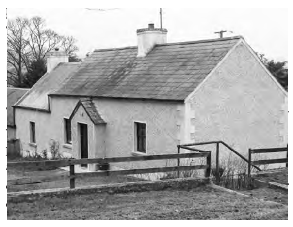
McNally's House today