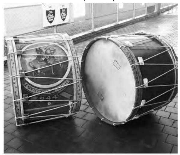
The Lambeg Drums

recounts the incident just described and continues):..." the party entered Poyntzpass and at intervals shouts of the most disloyal nature were used by some of those in the throng. The people of the town were very much alarmed, as never on any previous anniversary had such a demonstration been seen on the streets of Poyntzpass. They coolly halted at Mrs Rice's Public House in the main street and refreshed themselves very liberally"