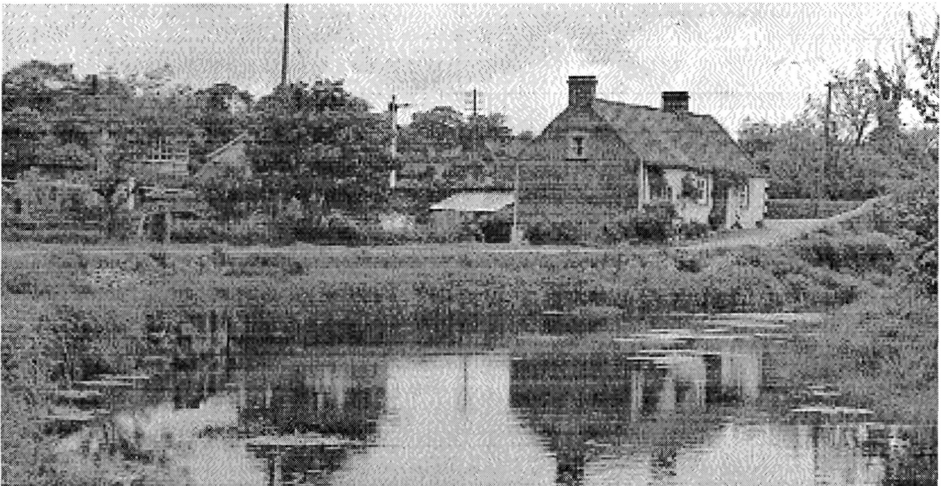
Moodys Lockhouse at Poyntzpass.