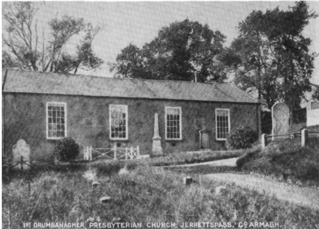
1st Drumbanagher Presbyterian Church, Jerrettspass

Through time the spelling changed the 'Jerritz Pass' and then to the present name of Jerrettspass.