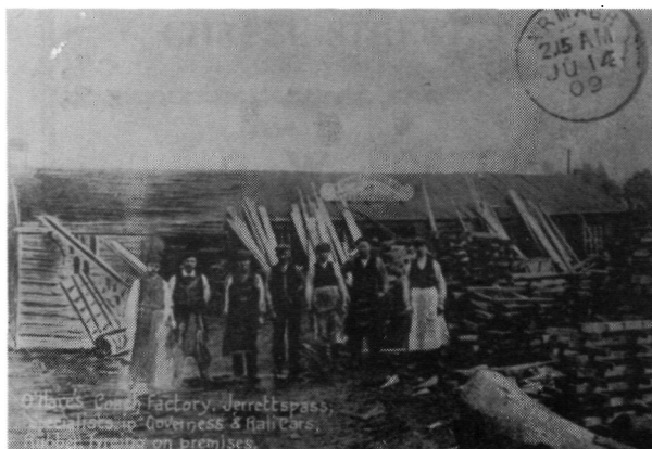
O'Hare's Coach Factory Jerrettspass 1909 “Specialists in Governess and Rail Cars, Rubber Tyreing on Premises”

Many local people also worked in the granite quarry at Goraghowood which was also owned by the Railway Company and the stone quarried was used in the upkeep of the railway lines and bridges throughout Northern Ireland. However this industry also died with the closing of the station.