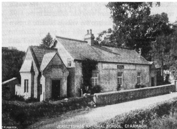
Jerrettspass National School

In 1972 the school was closed and the pupils transferred to Poyntzpass and then in 1975 the building was demolished having fallen into a state of disrepair.