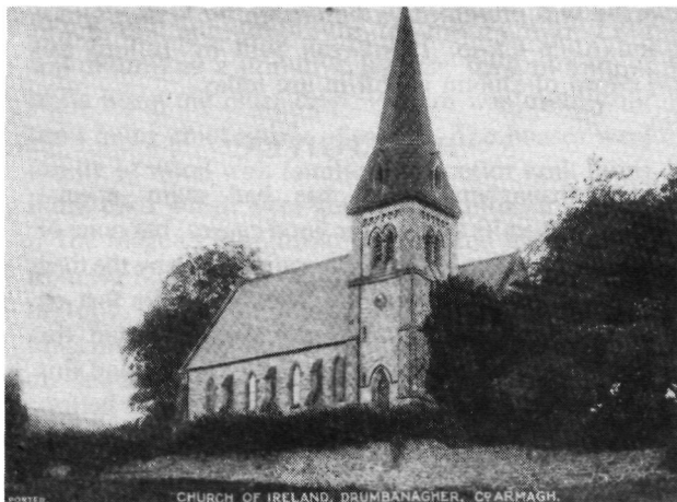
Church of Ireland, Drumbanagher