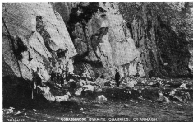
Goraghowood granite quarries

three arch stone bridge crossing a small stream on the Armagh - Goraghowood line with a total of ten bridges in the Jerrettspass area alone.