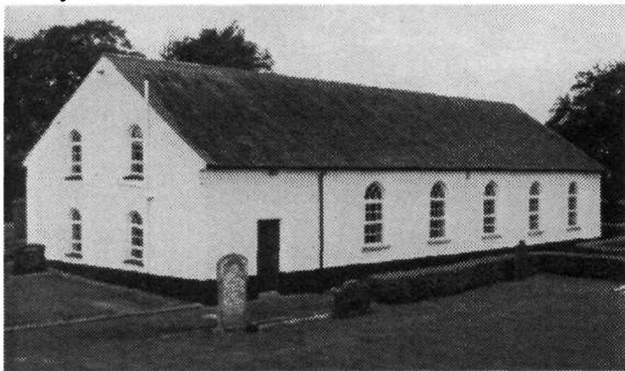
Cremore Presbyterian Church

The congregation of Cremore celebrated the bicentennial of their church in 2002. Since it was built in 1802, the Church has, in its two hundred years, seen many changes. It was built in the style of a 'barn' church that was very common in the early years of many congregations. The interior of the church has changed considerably over the years. Originally there was a central aisle with doors at each end - the present entrance door and another door which was situated behind where the pulpit is today. At that time the pulpit was placed in the centre of the long wall at the rear of the church, away from the road.