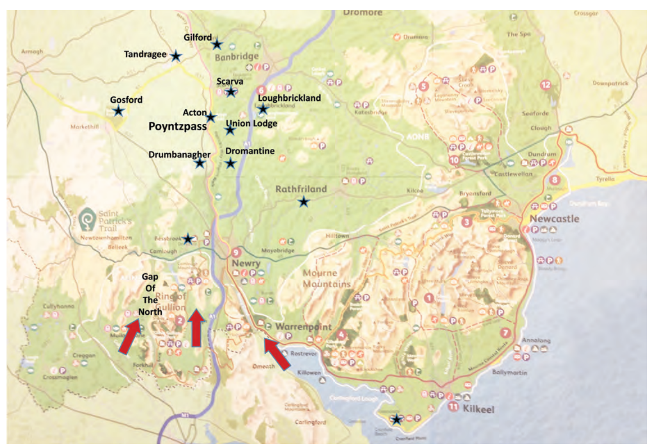
Map showing the camps in the area

Two less direct impacts were (a) the severe censorship of all news and (b) the preparations for defence should the German forces put into effect their Operation Sea Lion plan to invade England, and its subsidiary, though less thought through Operation Green to invade the Irish Free State (as the RoI was then called) in its south east corner, and thence move north via the Dublin-Belfast corridor, thus making Jerrettspass and Poyntzpass in the direct path.