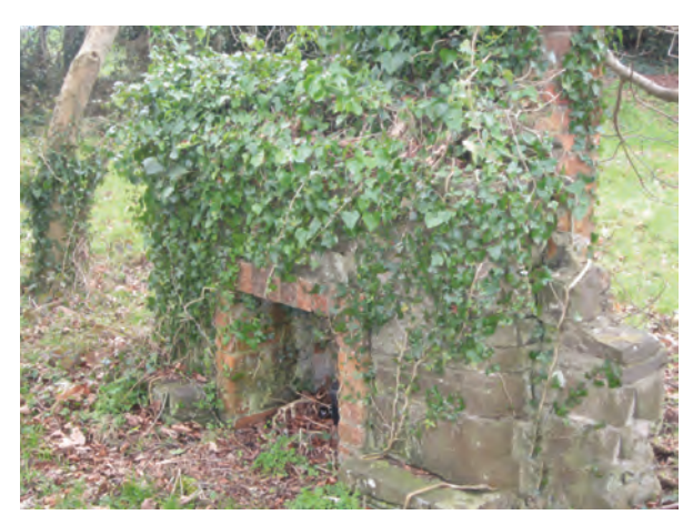
The Fireplace of the Officers' Mess, Acton camp.

The locals seem to have been united in the welcome they extended to the troops for they soon made their presence felt and were frequent customers in the various cafes and tea-rooms which had sprung up in the village. They also attended the dances which were arranged in Rafferty's Loft, the Royal British Legion Hall and Drumbanagher Church Hall. Sometimes their attendance at dances led to friction between them and young local men and the Military Police had to be called on to quell disturbances.