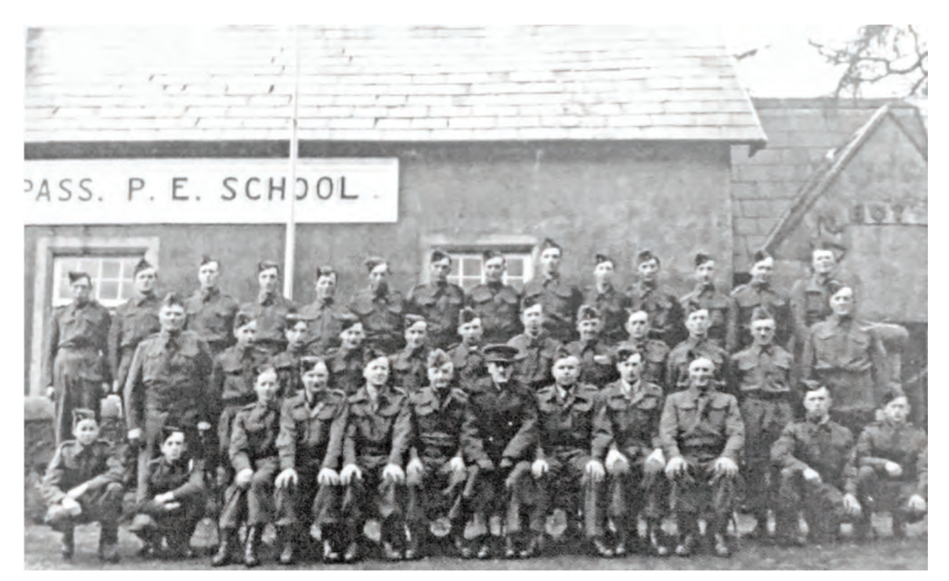
Jerrettspass Home Guard

some other equipment. The fire-fighters trained by pumping water from the Ball Alley River and Canal at Poyntzpass and the Connywarry in Acton and the First Aid crews by bandaging 'casualities'.