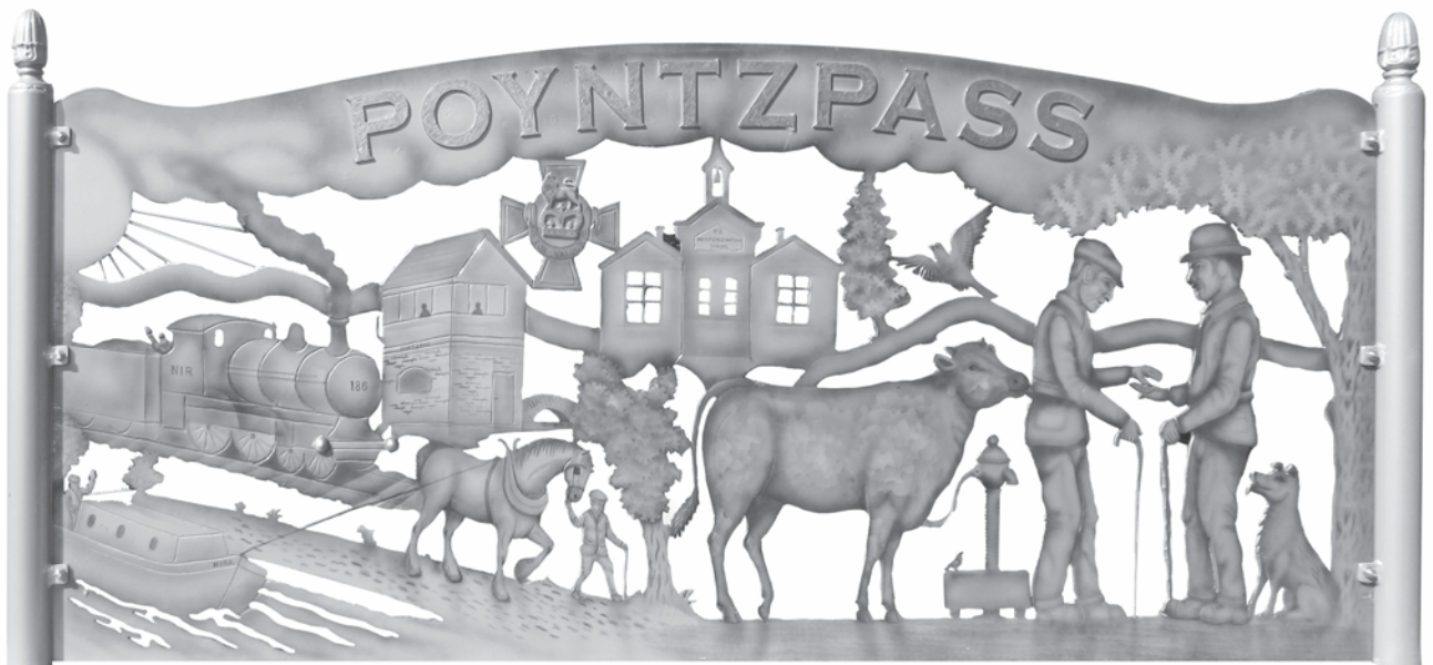
Artist, Billy McCaughern was also responsible for this frieze depicting Poyntzpass through the Ages, which was erected as part of a rural village enhancement scheme organised by Armagh City Council. The artwork depicts the growth of the village through the ages by including those elements which were important in its evolution.