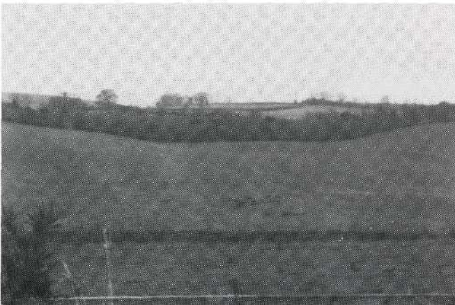
North of Ballydougherty Halt