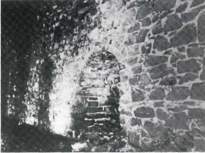
Interior of tunnel showing recesses